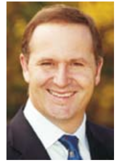
Prime Minister Right Hon John Key